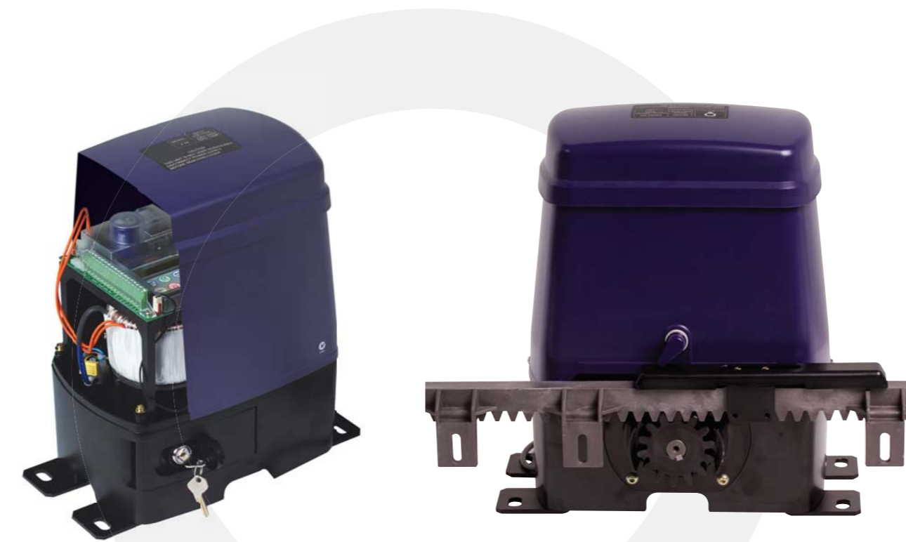
ESV-24 with case cut away to show the Logic Control System with LCD display and transformer assembly